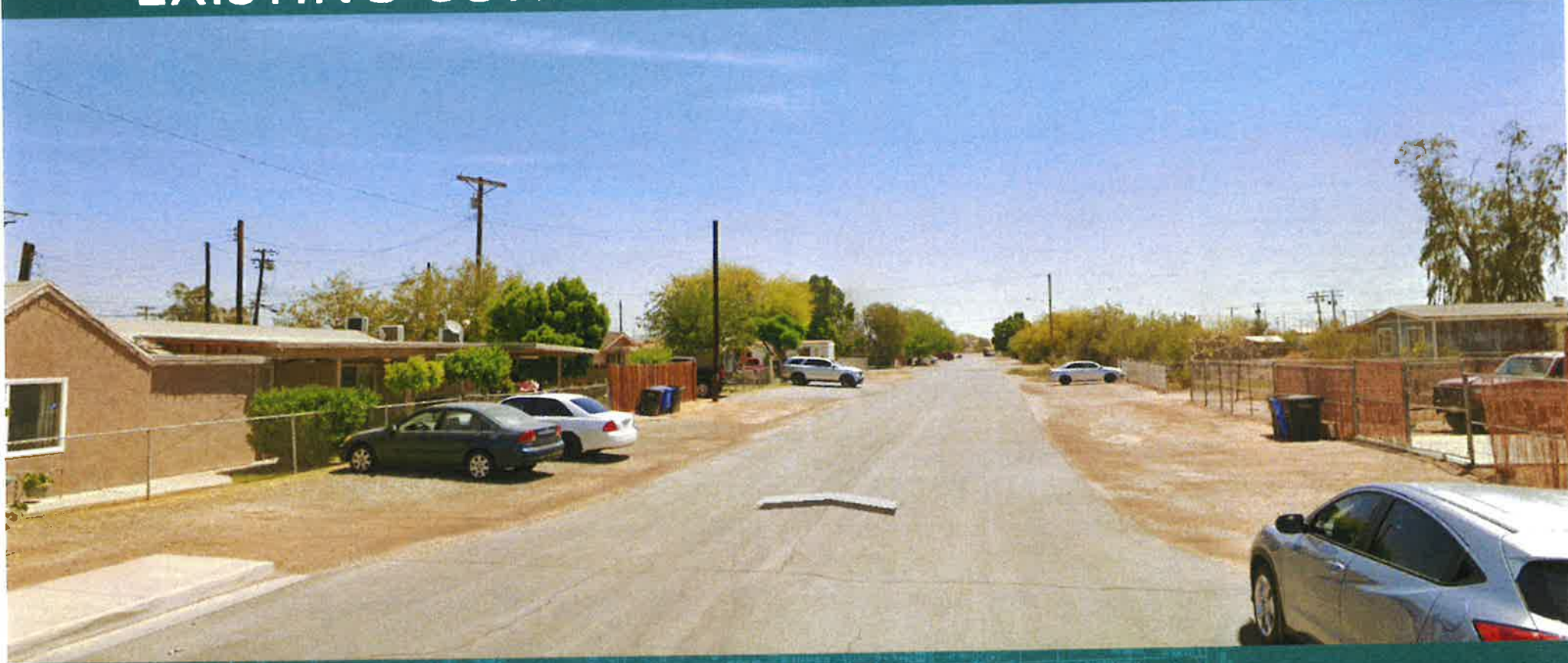
East 7 th Street at Heber Avenue, looking east