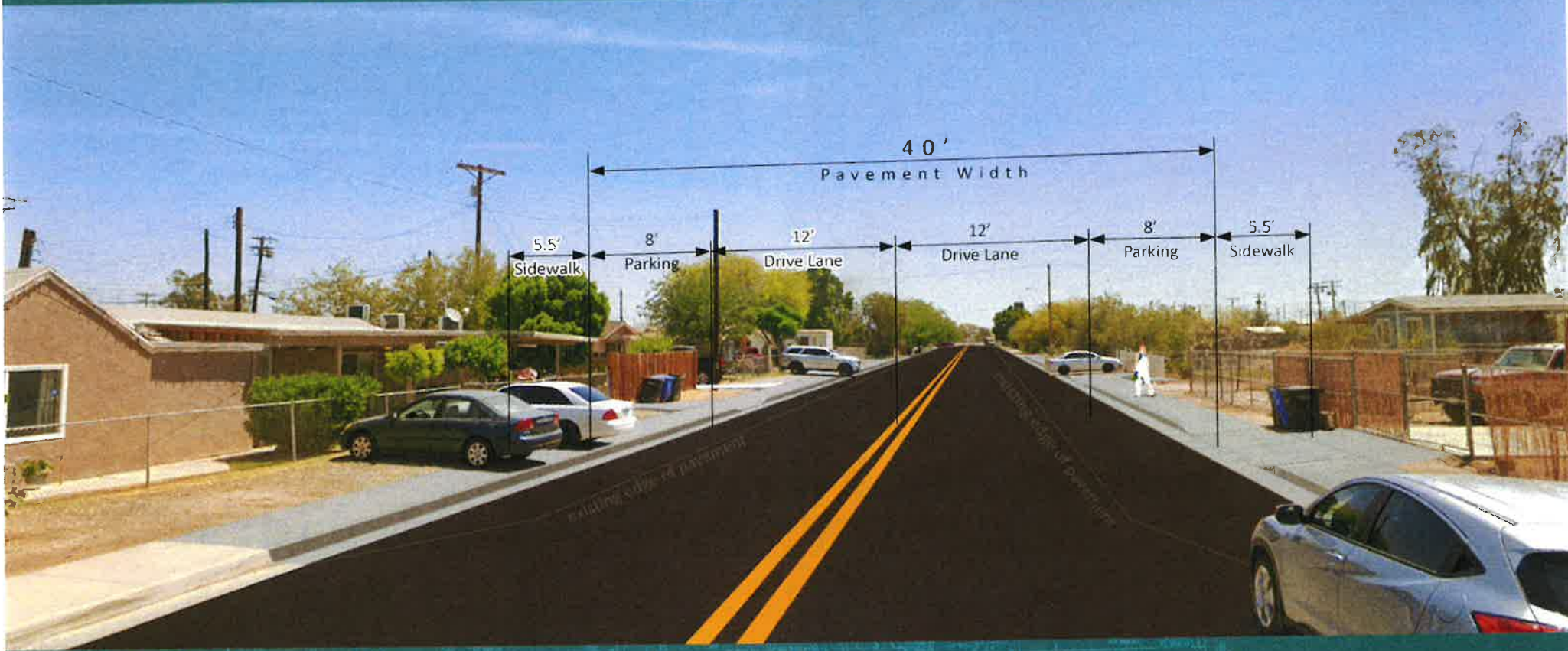
East 7 th Street at Heber Avenue, looking east