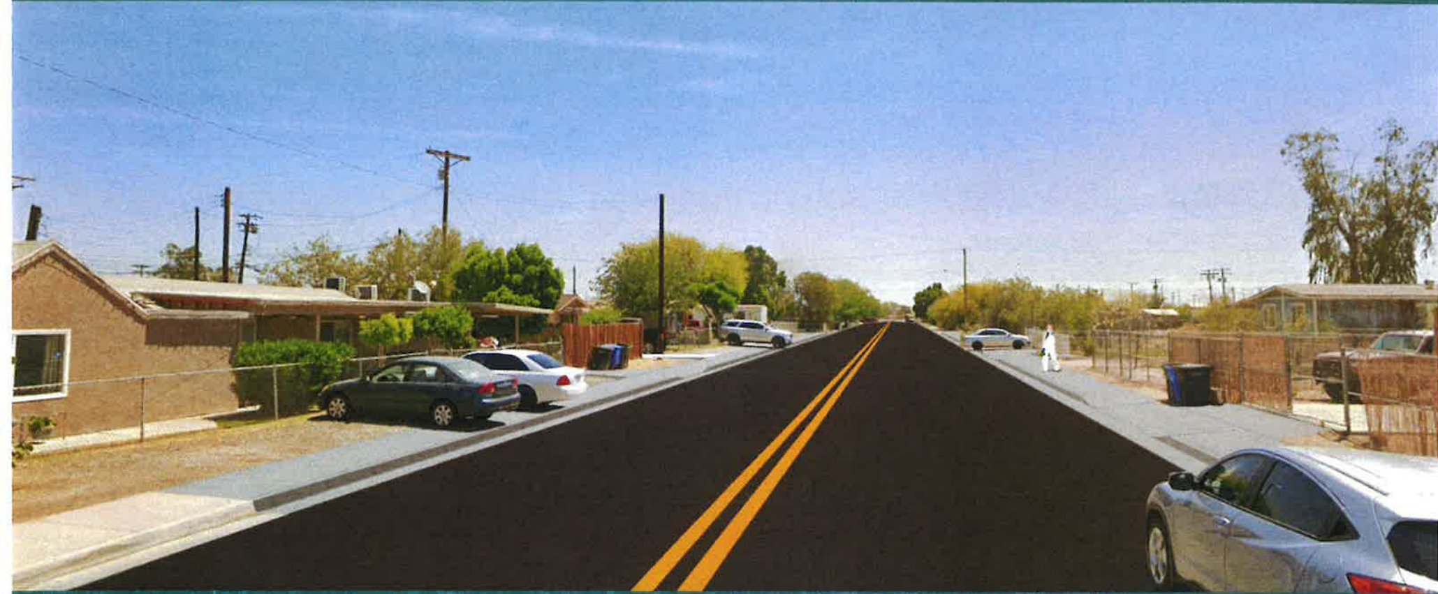
East 7 th Street at Heber Avenue, looking east

Project No. 2019-001 City of Phoenix Department of Transportation Division of Traffic Engineering 1500 North Central Avenue Phoenix, Arizona 85004 Phone: (602) 350-3300 www.phoenix.gov